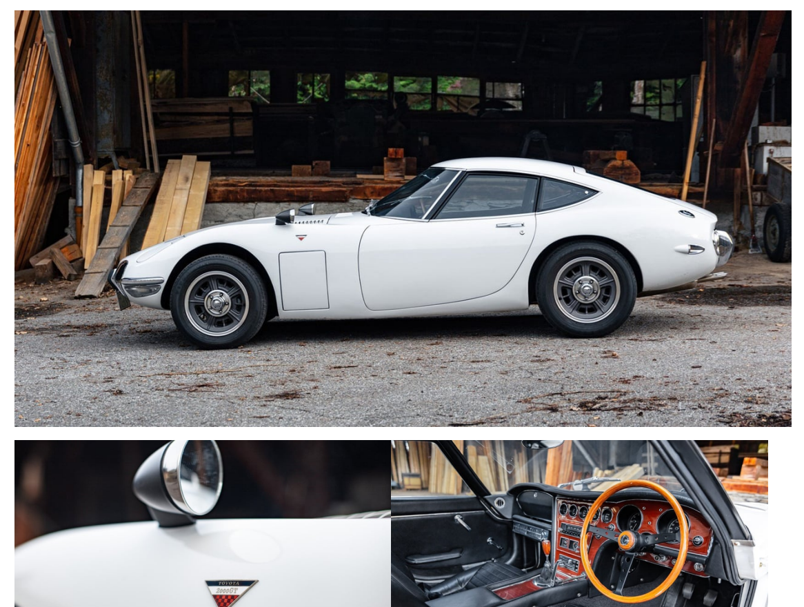
In 1967, while Toyota were slugging away producing mass-market machines like the Corolla and Corona, sun-drenched Italian car makers were gleefully enjoying the golden age of supercars. Ferrari had the 275 GTB, Lamborghini had the freshly launched Miura, while Maserati, Fiat and Alfa Romeo all also wanted a slice of that sweet, sweet gran tourer action. Not to mention Jaguar with their silky smooth E-Type, and Porsche hadn't long released that strangely-named car called the 911? That'll never catch on...

It's a car that truly needs no introduction, Toyota's first and only dip into the illustrious and highly competitive supercar market turned out to be an instant hit. Now, this incredible Toyota 2000GT heads to the upcoming RM Sotheby's Paris sale on the 1st February.