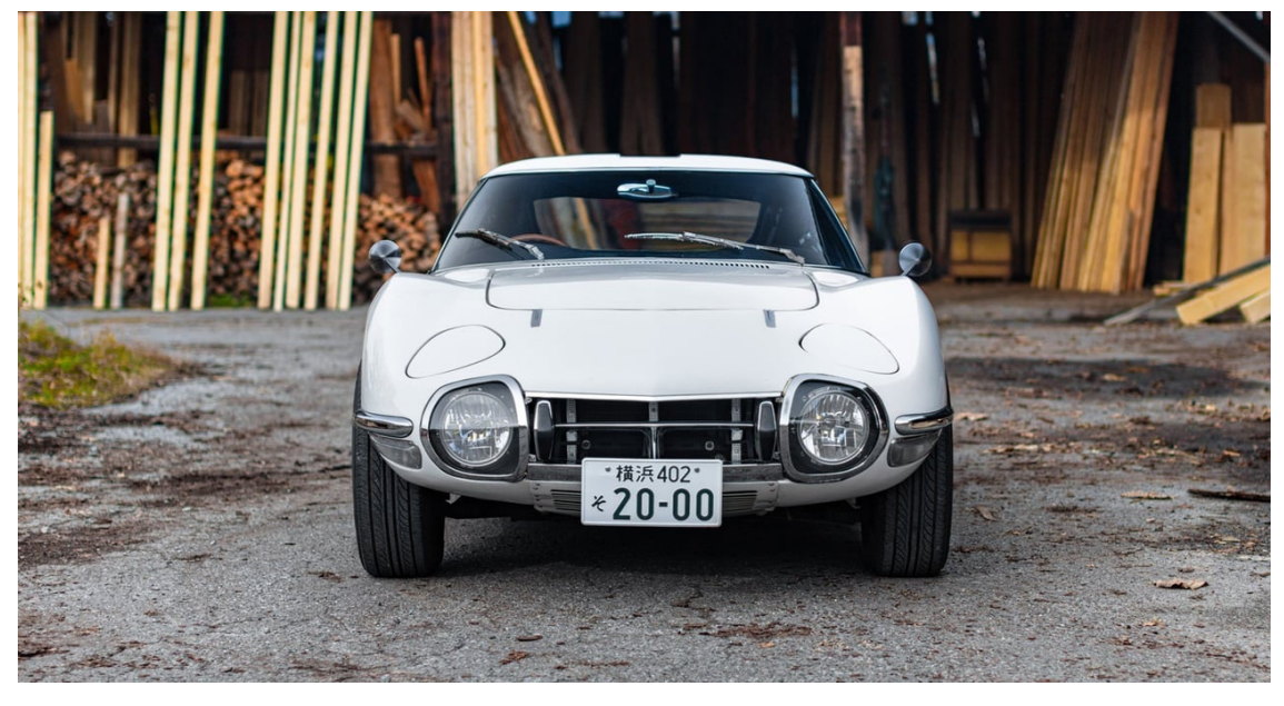
While golden era Ferraris and Lamborghinis will always hold their own against most supercars, the Toyota 2000GT is a supercar that was made purely for the purposes of experimentation, from a motivation to be the very best in any sector, all wrapped up in a gloriously stylish and sophisticated package. This fantastic example is set to stun the crowds and set the bidding alight at the upcoming <u>RM Sotheby's Paris sale</u> on the 1st February, with an estimate of EUR 500,000 – 700,000.

Despite the initial wave of excitement and ambition, just 337 2000GTs were ever made, mostly due to the production costs and Toyota having to focus on the real moneymakers in the form of the Celica and Corollas, but the 2000GT remains a true motoring icon. This example, finished in Pegasus White, is a right-hand-drive example that was restored before being imported from Japan in 2013. Since arriving in Europe, it has been a focal point in a Toyota showroom and made appearances at various shows around Europe, no doubt causing quite the stir wherever it ends up.