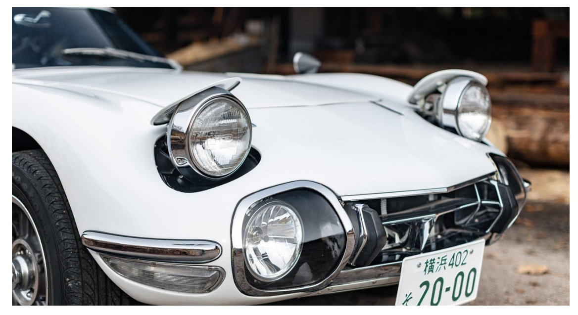
Toyota, however, had no real business being amongst these brands. The Japanese firm's key ethos, even back when it was born in 1937 was to create cars for people to enjoy, feel safe in and carry with them whatever they desire. These are traits not usually found in supercars, but in the middle of 1960, Toyota felt the time was right to down the mass-market tools and create a car that proved Japan could do luxury and performance, and so, the 2000GT project began.

Toyota called upon Yamaha to collaborate on the 2000GT, which was officially unveiled at the 1965 Tokyo Motor Show to a flurry on onlookers from around the world. It was a car that procured inspiration from every brand within the sector – its rear suspension and chassis components were a clear nod to Lotus, while the 2-litre twin-cam straight-six was like that of an Aston Martin or Jaguar. Of course, the styling too was something that stunned so many, featuring an elongated front-end with almost no seams, only that of a small front-hinged bonnet that housed the 148-horsepower heart of the 2000 GT. Its design was somethow familiar, yet so original and exciting at the same time, with a Zagato-esk double-bubble roof and curvaceous rear panels. The result is a truly beautiful looking car, one that many regard even today as being one of the best-looking classic cars ever made, especially after seeing 007 behind the wheel of a convertible version in You Only Live Twice.