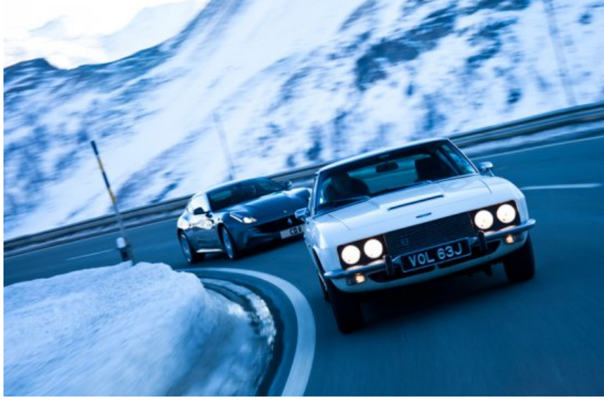
'Ferguson Formula': 'FF'. Neat, don't you think?