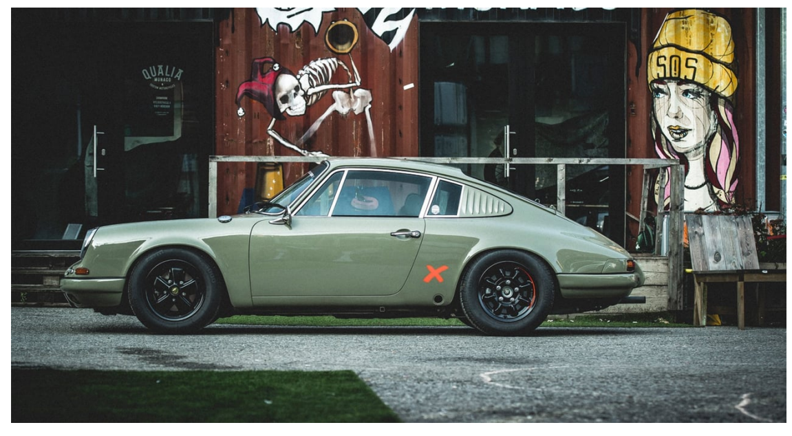
As we draw closer to the event, we'll be bringing you further updates, but to secure your place be sure to head to the Luftgekült and act quickly, as tickets sell out quicker than your average 911's 0-62mph time!

If you can't already tell, we're pretty excited to immerse ourselves in the smell of petrol and pierogies, having embraced the party in previous European Luftgekült editions that included Munich and Bicester Heritage in Oxfordshire. Taking place on the 14th and 15th of June 2024, Porsche and photography enthusiasts alike will get to witness automotive gems from the Porsche Museum, Porsche Classic, Singer, Club De Ultrace and Hel Riders against never-before-seen backdrops, making for a truly unique couple of days in the Polish sunshine.